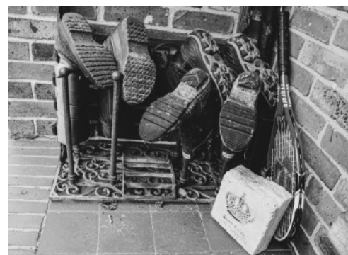
Shoes, wet weather tennis.

Are there any resources, books, or websites that you find particularly helpful? Photocrowd is an invaluable resource. Comparing my work to the incredible work of international photographers is inspiring and humbling. I also aim to take about two courses a month, which keeps and continuously learning.