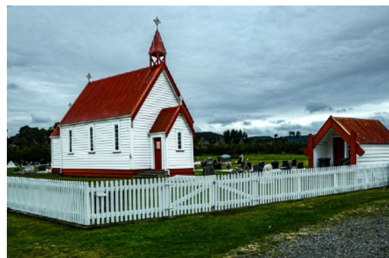
Waitetoko Marae Church